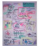
Wiltshire's Partnership Board Story so far Priorities for the next Five Years